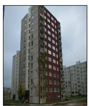
Fig. 5. Structural system VPOS