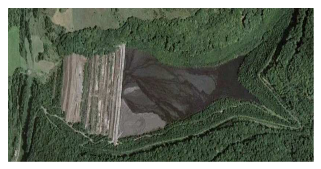
Fig. 2 Valley desludging site for metalliferous waste

Slovak standard uses the following definition for these technical works: Desludging site is naturally or artificially formed location on surface used for permanent or temporary depositing of sludge (waste), which is mostly deposited by hydraulic methods. The definition of desludging site results in its being classified as object studied by two disciplines: it is hydrologic work, i.e. engineering output of hydrologic construction and water management, although waste can be produced by power engineering, mining, metallurgy and chemical industry. Another group of sciences is the field of exploiting both metalliferous and non-metalliferous raw materials, the waste thus being only produced by mining and related activities. In general, desludging sites are classified by their origin of waste, location on surface (valley, hillside and plain, Figs.2 to 4), use of transport water (flow-through and circulation). Further, additional classification is conventional: elevation of dike system, total capacity, waste production, type of dike, flow rate of surface waters, method of elevating dike body, etc. It is obvious that desludging sites represent a set of works and burdens of various types, sizes, categories and stages of existence. They are objects of interest for organizations in the fields of survey, research, design, suppliers, investors, supervisory and legislation bodies and state authorities.