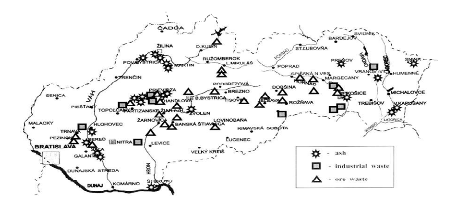
Fig. 1 Registered desludging sites in Slovakia

Slovakia is a country with small area. The rock environment is, however, highly variable from the point of geology and hydrogeology, just like the inhabitants who produce waste in diverse activities. Officially registered desludging sites of Slovak Republic are shown in the Fig.1. These are defined (according to the ICOLD classification) as hydrological construction works of category I. to IV. and are subject to mandatory technical safety supervision. Together, these make 50 desludging sites with various types of deposited materials in various stages of their existence. Some of these have been reclaimed, many are in attenuated operation, other are in stage of intensification and some are regularly operated. Existence of desludging sites represents a wide set of geotechnical problems related to preparation, design, construction, operation, intensification, reclamation and use of this structures. Most of the deposited geomaterials are wastes from power plants and heating plants (cinders and ashes) and products of treatment plants for ores (flotation sludge). Sludge from chemical facilities does not have any uniform characteristics and each type of sludge has to be assessed individually.