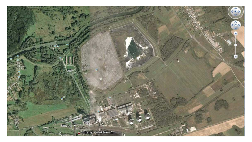
Fig. 4 Plain desludging site of ash waste

operation, in long-term existence and introduction into harmless state. In practice, the state of desludging sites after their operation has ended cannot be deemed harmless because desludging site represents a permanent environmental burden to the land. Accidents are also caused by absence of monitoring, insufficient maintenance and expiration of service life. Destruction of dike may occur, overload or subsequent accident of the desludging site due to water in the desludging site body, because of climatic changes, dynamic effects or as a result of change of strength characteristics of deposited geomaterials, or through changes in soil structure interaction. The role of geotechnics is to solve the principal issues of desludging sites existence: stability (static and filtration), define risks (survey, design, operation, long-term existence) and propose monitoring (of water and its effects, deformation of the body, soil structure interaction).